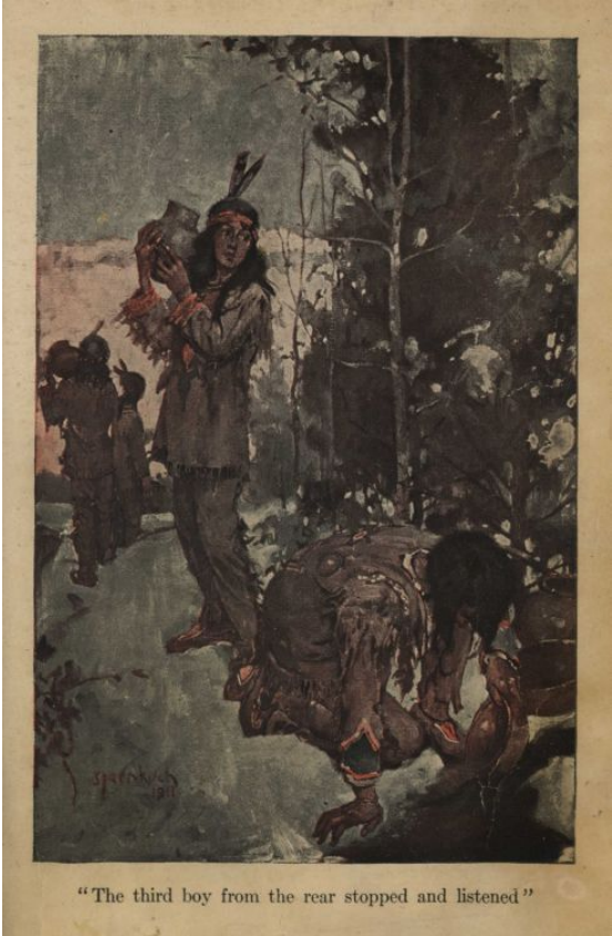
"The third boy from the rear stopped and listened"

longer than the others. But the sound had been so faint, so clever an approach to the sighing of the wind among the pines, that the other boys seemed to take no notice of it. Arenberg was moving along in a parallel line with them, keeping behind the pines. Phil followed close behind him, and once more he put his hand on his arm. Now he felt, with increasing force, that the man was shaken by some tremendous internal excitement.