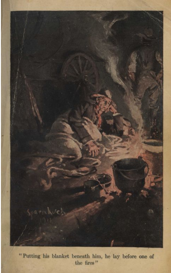
"Putting his blanket beneath him, he lay before one of the fires"