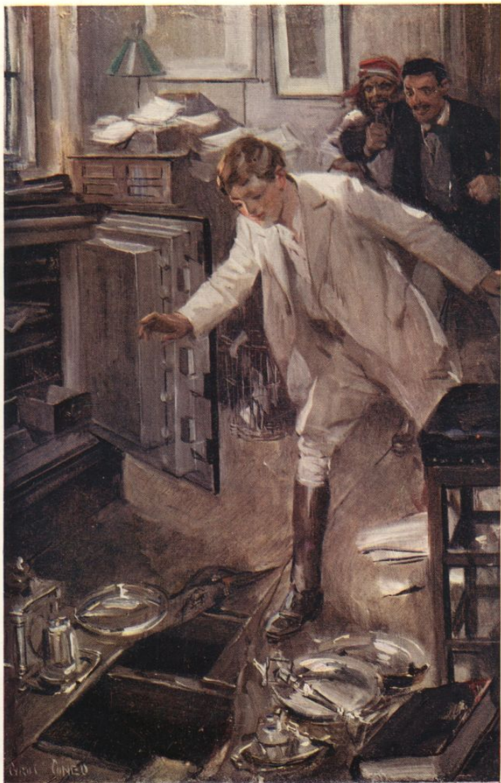
THE HOLE IN THE FLOOR