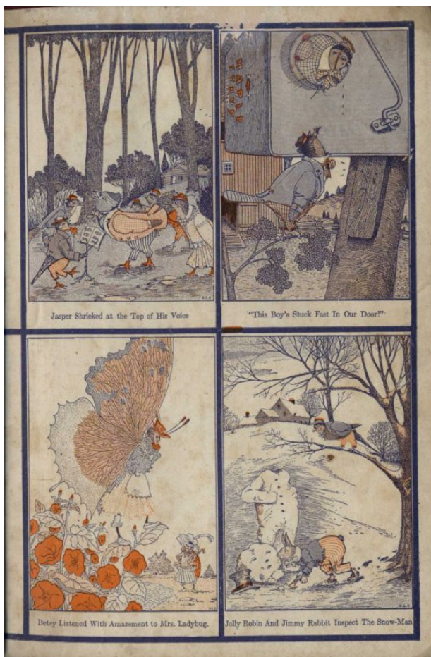
Front end paper - right half