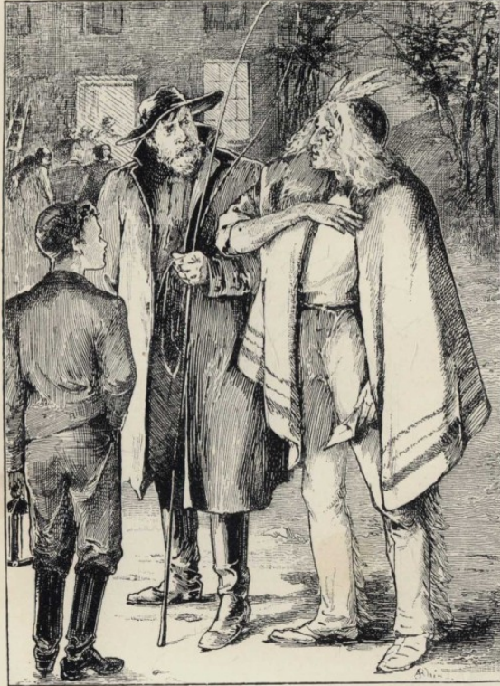
THE OLD CHIEF.