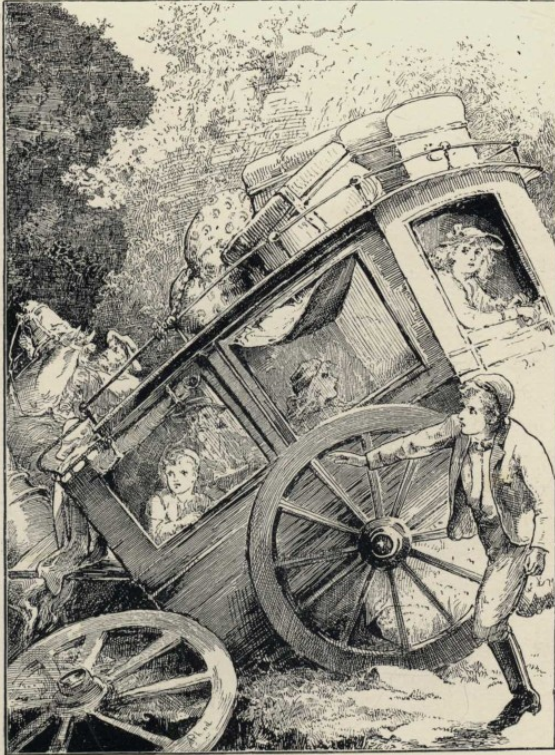
AN AWKWARD PLIGHT.