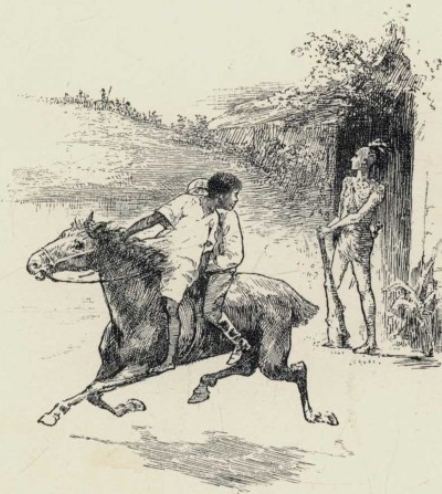
FLEEING FROM THE TANA.