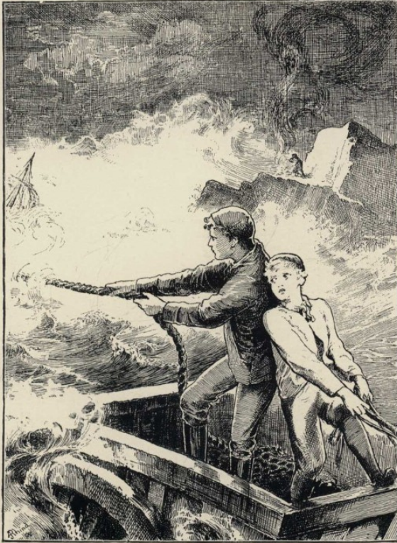
A PERILOUS RESCUE.