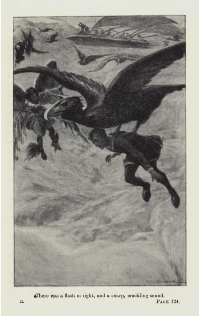
There was a flash of light, and a sharp, crackling sound. M. PAGE 124.

There was a flash of light, and a sharp, crackling sound.