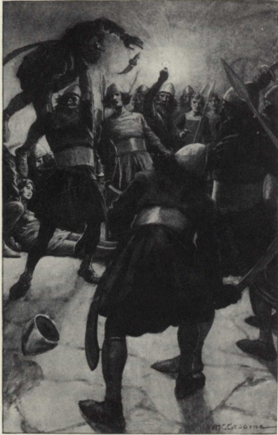
The assailant was lifted high in the air and flung down with terrible force.