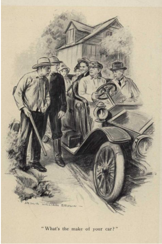
“What’s the make of your car?”