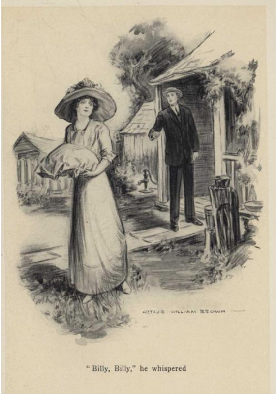
"Billy, Billy," he whispered