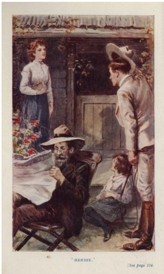
'HERMIE.' (See page 134.)