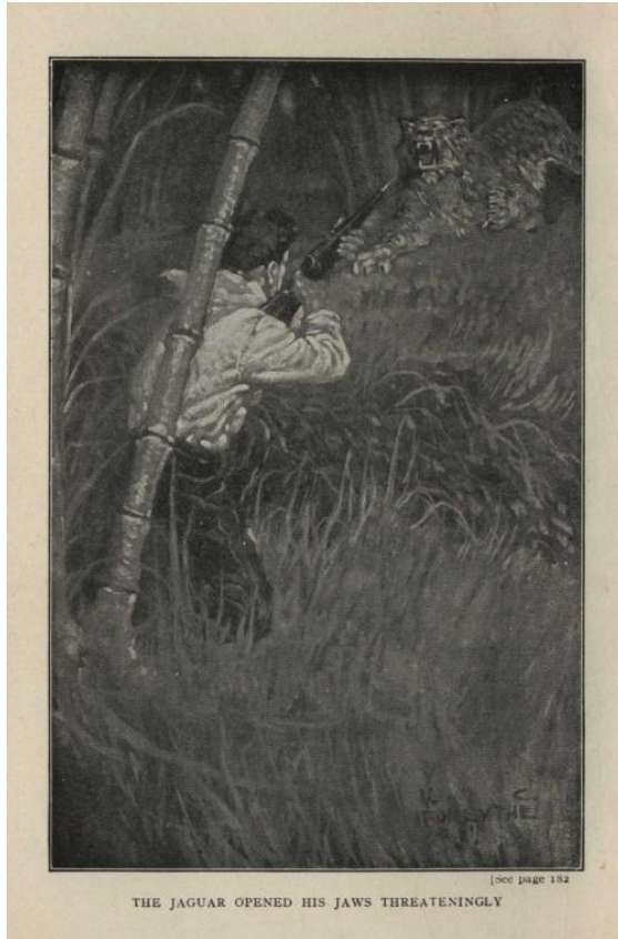
THE JAGUAR OPENED HIS JAWS THREATENINGLY (see page 182)