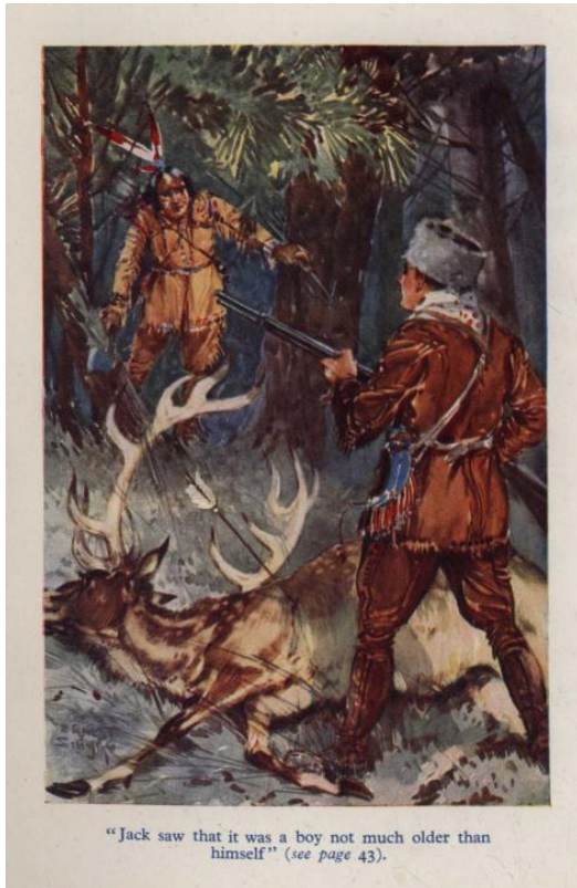
"Jack saw that it was a boy not much older than himself" (see page 43).