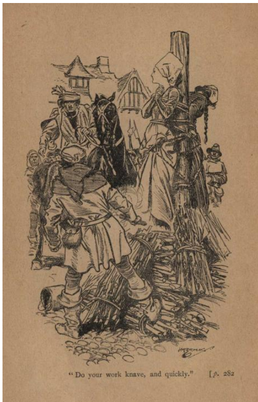
"Do your work knave, and quickly." (p. 282)