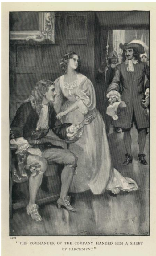
"THE COMMANDER OF THE COMPANY HANDED HIM A SHEET OF PARCHMENT"