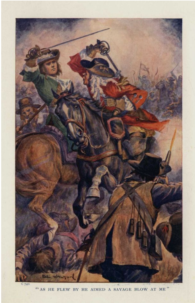
"AS HE FLEW BY HE AIMED A SAVAGE BLOW AT ME" (Page 217)