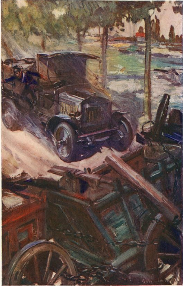
CLEARING THE ROAD