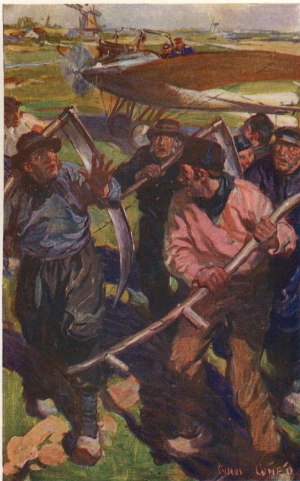
"THE PEASANTS SCATTERED OUT OF ITS PATH"