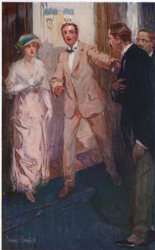
THE SPY UNMASKED