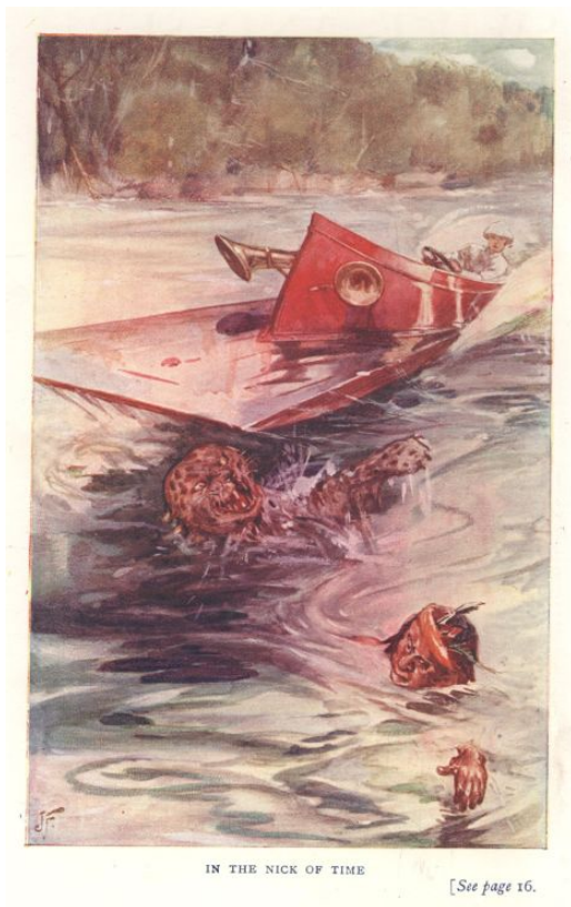
IN THE NICK OF TIME