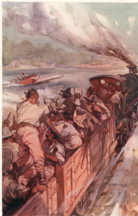
THE RACE TO THE SWIFT