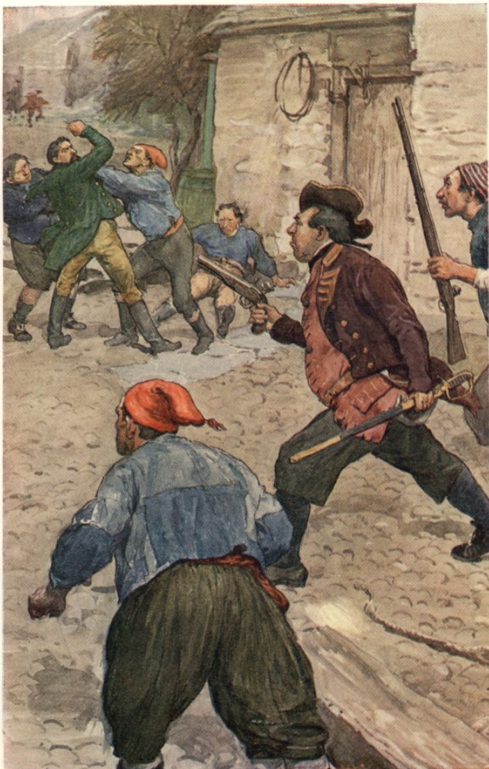
"DELAROUSSE RUSHED HEADLONG TOWARDS THE APPROACHING GROUP."