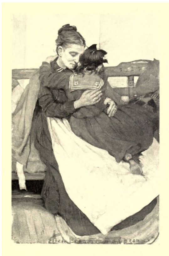
"Hazel flung both arms around Mrs. Blossom's neck"

you were mine! I love you so—" Hazel flung both arms around Mrs. Blossom's neck and sobbed out,— "I 've wanted to call you Mother Blossom and hug and kiss you like the rest—but Cherry was so jealous—the first time I did it—that she—she stuck burrs in my bed and led me through the nettle-patch when we were raspberrying, because she knew I did n't know nettles; and Chi told me we 'd got to be brave if we joined the N.B.B.O.O., and I knew I ought to bear it—for I do love to be here—and I love them all, for most of the time they 're lovely to me;—and I don't think you 've been horrid, Rose, only you did hurt my feelings when you would n't let me give you the blue silk—and—and it is n't my fault if I am rich, and it is n't fair not to like me for it!"