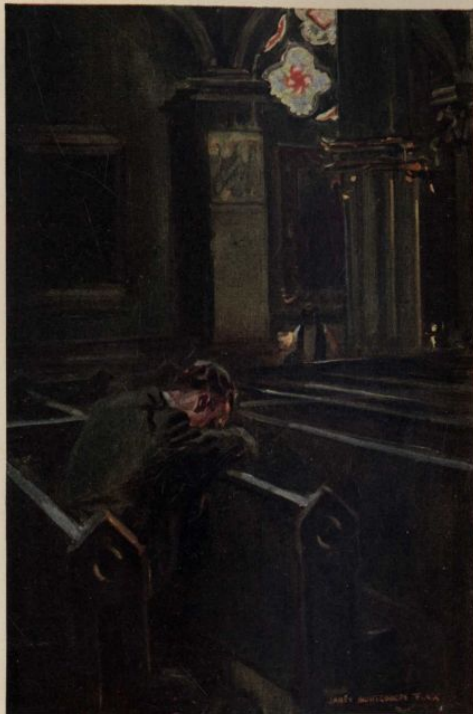
An acolyte, entering in the gray of the early morning, saw on the last of the kneeling benches a man resting with bowed head