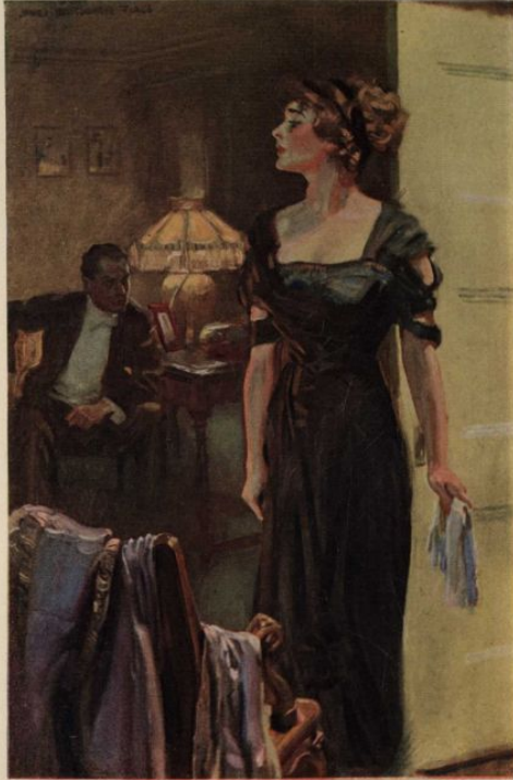
"I despise your threats," she said, choking with her own words. "I despise you."

"I despise your threats," she said choking with her own words. "I despise you."