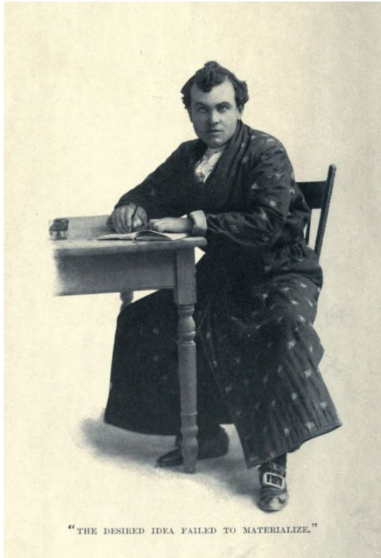
THE DESIRED IDEA FAILED TO MATERIALIZE.