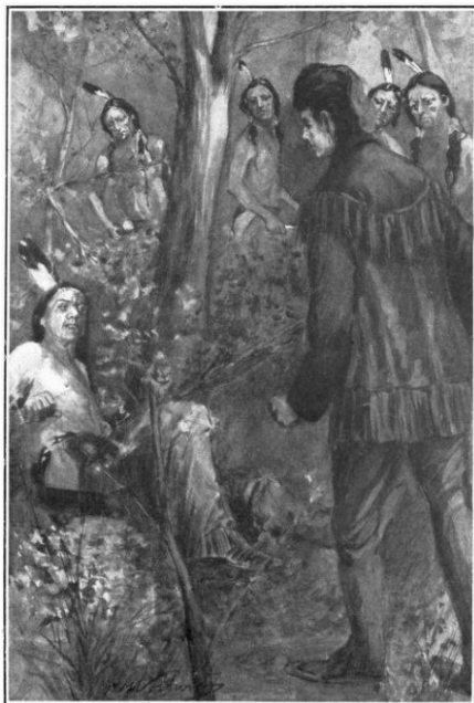
HE WHEELED AND SENT THE REDSKIN SPRAWLING.

poplar and without the least trouble reached its shelter not many minutes later.