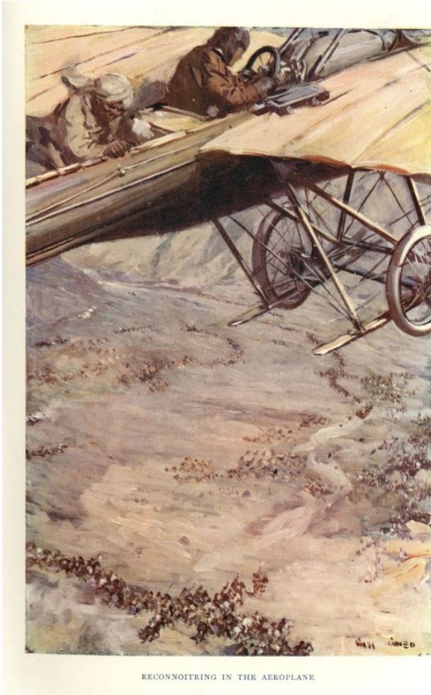
RECONNOITRING IN THE AEROPLANE