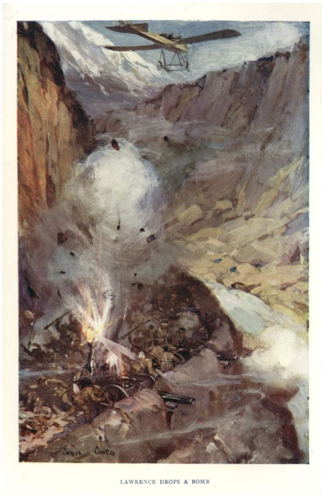
LAWRENCE DROPS A BOMB