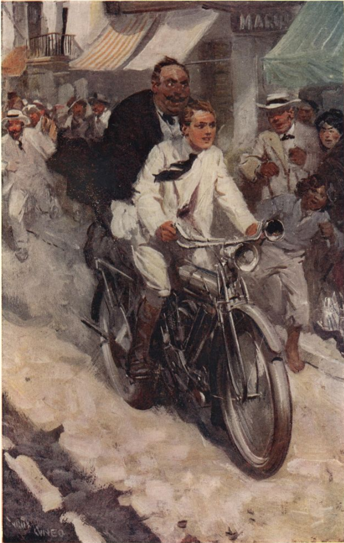
THE GOBERNADOR RIDES