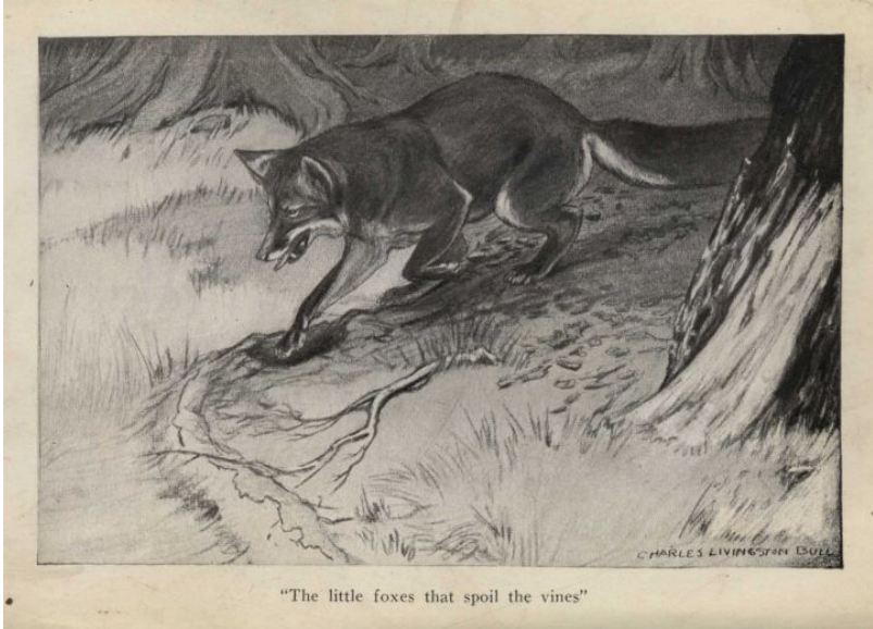
"The little foxes that spoil the vines"