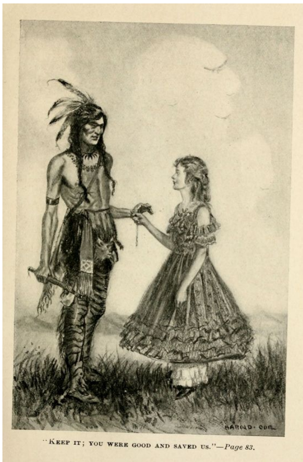
"KEEP IT; YOU WERE GOOD AND SAVED US."—Page 83.