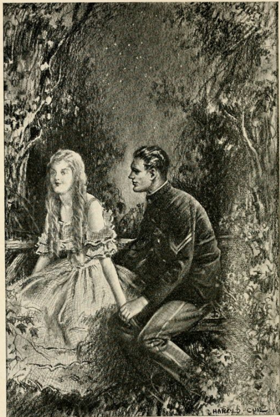
"SOMETHING NEARER, DEARER, SWEETER THAN A SISTER—I WANT YOU FOR MY WIFE!"—Page 356.