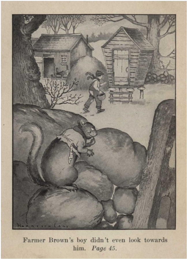
Farmer Brown's boy didn't even look towards him. Page 45.

in all his life, more corn than he had supposed the whole world held! Chatterer made up his mind right then and there that he was going to have some of that corn in spite of Black Pussy and Bowser the Hound and Farmer Brown's boy. The very sight of it screwed his courage up till he felt brave enough to dare anything.