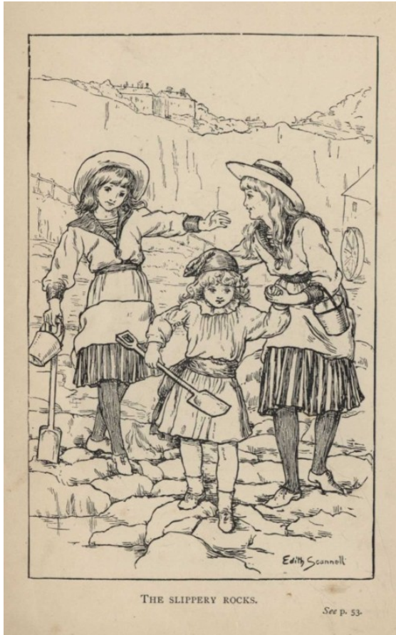
THE SLIPPERY ROCKS. See p. 53.