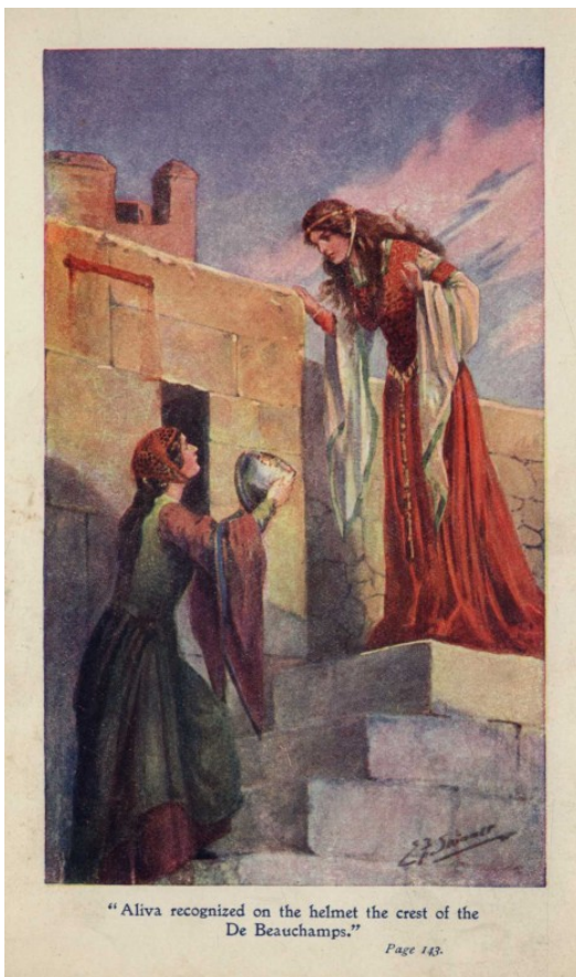
"Aliva recognized on the helmet the crest of the De Beauchamps." Page 143.