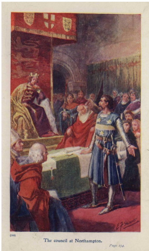
The council at Northampton.