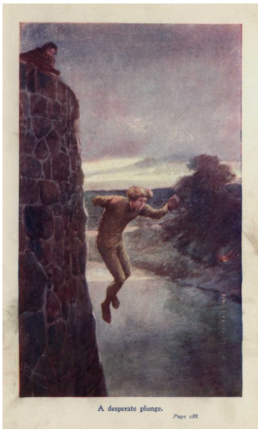
A desperate plunge.