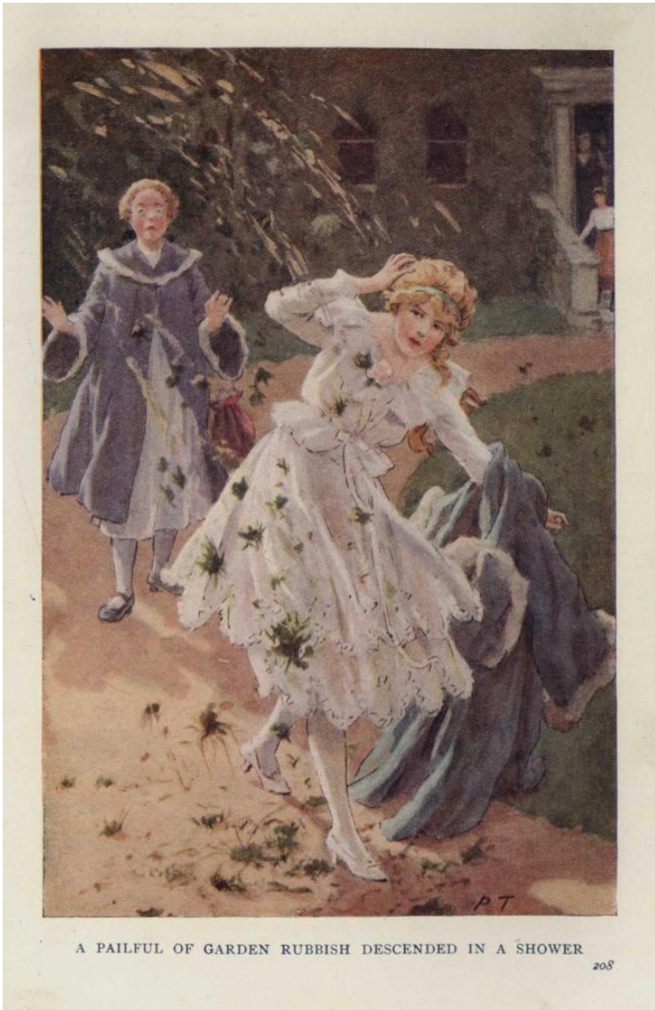
A PAILFUL OF GARDEN RUBBISH DESCENDED IN A SHOWER