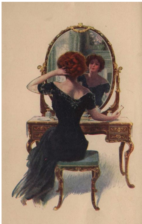
As she sat before her mirror...