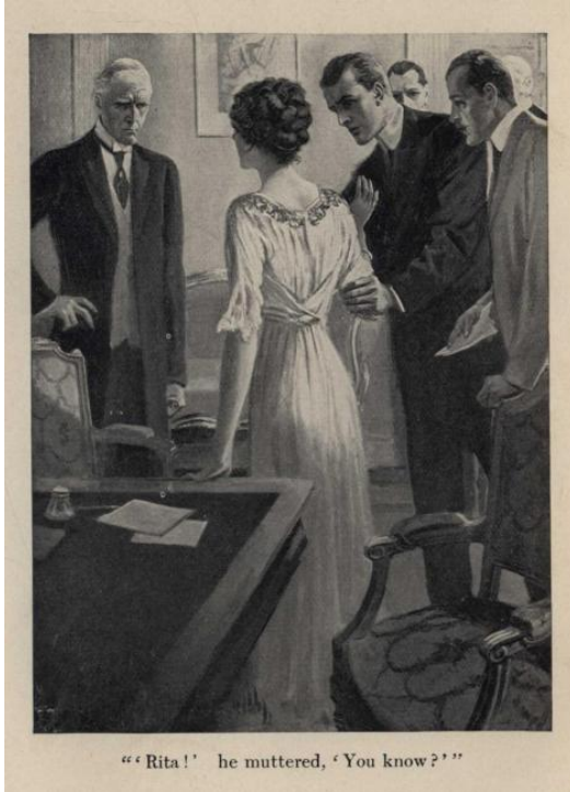
“ ‘ Rita!’ he muttered, ‘ You know?’ ”