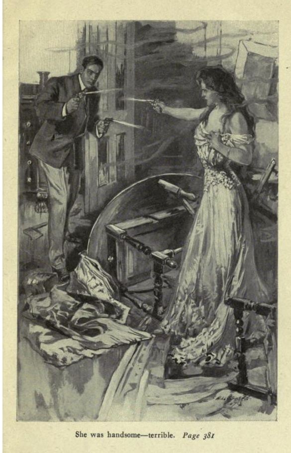
She was handsome—terrible. Page 381