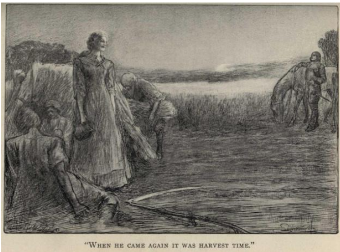
"WHEN HE CAME AGAIN IT WAS HARVEST TIME."

"Farewell, Jane! Darling Jane!"—then, afraid of his own temerity, he was away ere he could see the wonder and joy called into her face by the sweet familiar words.