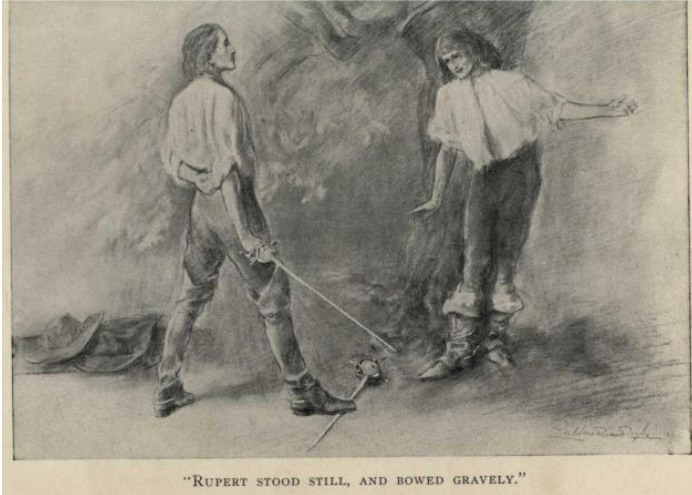
"RUPERT STOOD STILL, AND BOWED GRAVELY."

will had taken its place. Neville hastened forward, as he had been advised, and Rupert returned to Paris. He knew Matilda was expecting him, and he pictured to himself her disappointment and anxiety at his non-appearance; it was also her last evening in Paris, and it grieved him to miss precious hours of love, that might never be given him again. Yet he was physically exhausted, and as soon as he threw himself upon a couch he forgot all his weariness and all his anxieties in a deep sleep.