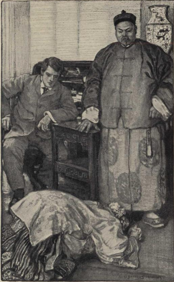
The girl threw herself on the floor Page 55