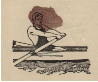
Title page picture

AUTHOR OF "Rex Kingdon of Ridgewood High," "Rex Kingdon in the the North Woods," "Rex Kingdon at Walcott Hall," "Rex Kingdon Behind the Bat," etc.