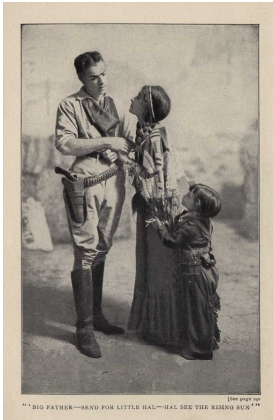
“BIG FATHER—SEND FOR LITTLE HAL—HAL SEE THE RISING SUN” See page 250