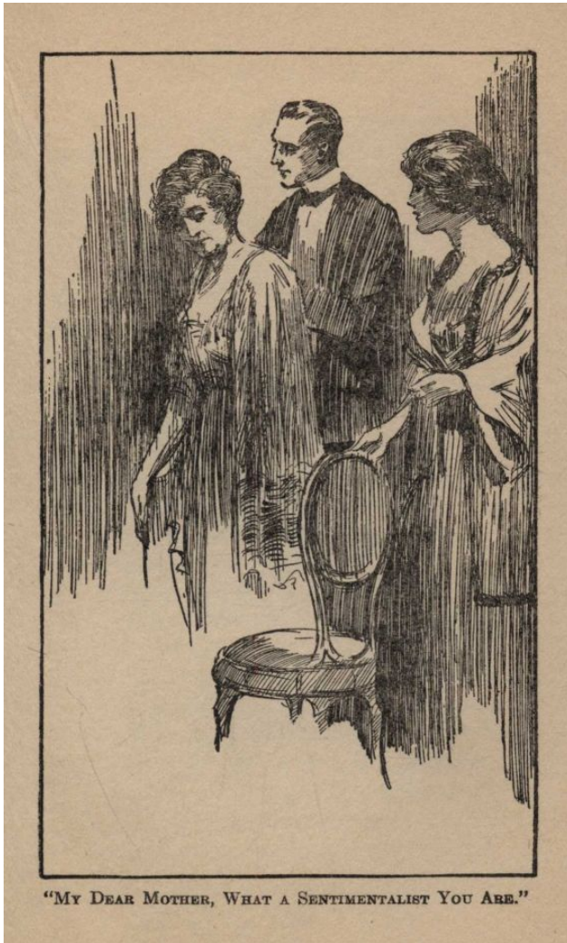
"MY DEAR MOTHER, WHAT A SENTIMENTALIST YOU ARE."

"My Dear Mother, What a Sentimentalist You Are."